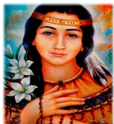
Saint Kateri Tekakwitha 1656-1680

St Oscar was born in El Salvador and learnt carpentry before becoming a priest. As Archbishop, he fearlessly preached against the civil war and murders occurring in his homeland. In a sermon on 23 March 1980, St Oscar ordered the army to stop killing people. The next day he was shot while celebrating Mass. St Oscar is a martyr - a person who gave his life for his faith in Jesus.